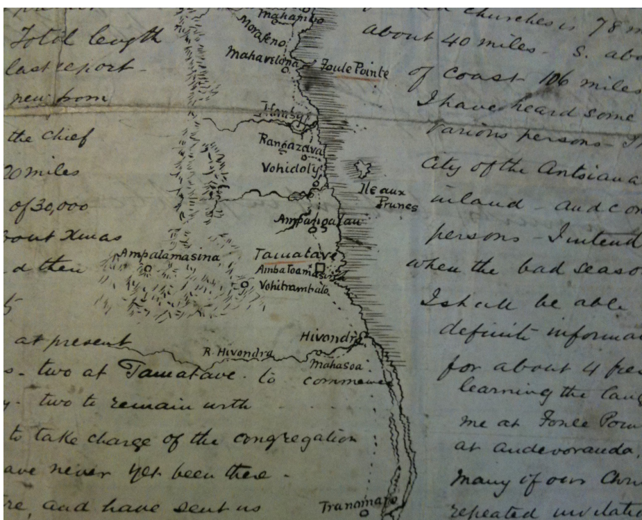
Figure 1: Excerpt of a letter dated 17 February 1868, written by the missionary Rev. A. Chiswell at present-day Toamasina, showing contemporary settlements along the east coast of Madagascar.

A compilation of annually resolved rainfall series for mainland southern Africa for the period 1850-1900 is shown in Figure 2. This includes seven series based on documentary evidence, three regional series from Nicholson et al. (2012) and, for comparison, a tree-ring-width-based rainfall reconstruction for western Zimbabwe (Therrell et al. 2006). All are for areas that receive most rainfall during the austral summer months (October-March). The compilation shows that relative rainfall levels were geographically variable across southern Africa. However, droughts that affected large areas can be identified (e.g. ~1850, early to mid-1860s, late 1870s, early to mid-1880s and mid- to late 1890s), in addition to a smaller number of coherent wetter years (e.g. 1863-1864 and 1890-1891). Multiproxy analyses indicate that the early to